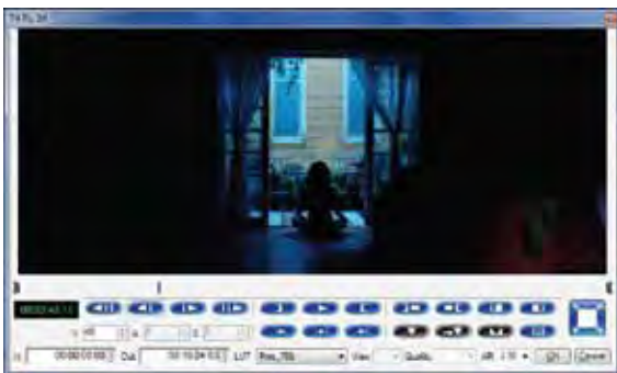
The Clip Editor

Thanks to its high efficiency JPEG2000 codec, the QubeMaster Pro system can also play JPEG2000 and MPEG 2 files in real-time within the Clip Editor or the new Preview Window. Best of all, both the Clip Editor and the Preview Window also support industry standard 3D LUTs for viewing XYZ and Log material with accurate color rendition on computer monitors. And when a Reel includes Subtitles, the system will render these on-screen with accurate fonts, positions and colors to provide you with as high quality a viewing experience as is possible on a non-DCI display device.